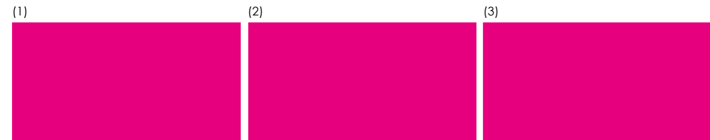
Copy for features