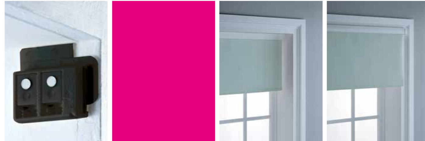
Guide Dog Recess Fix